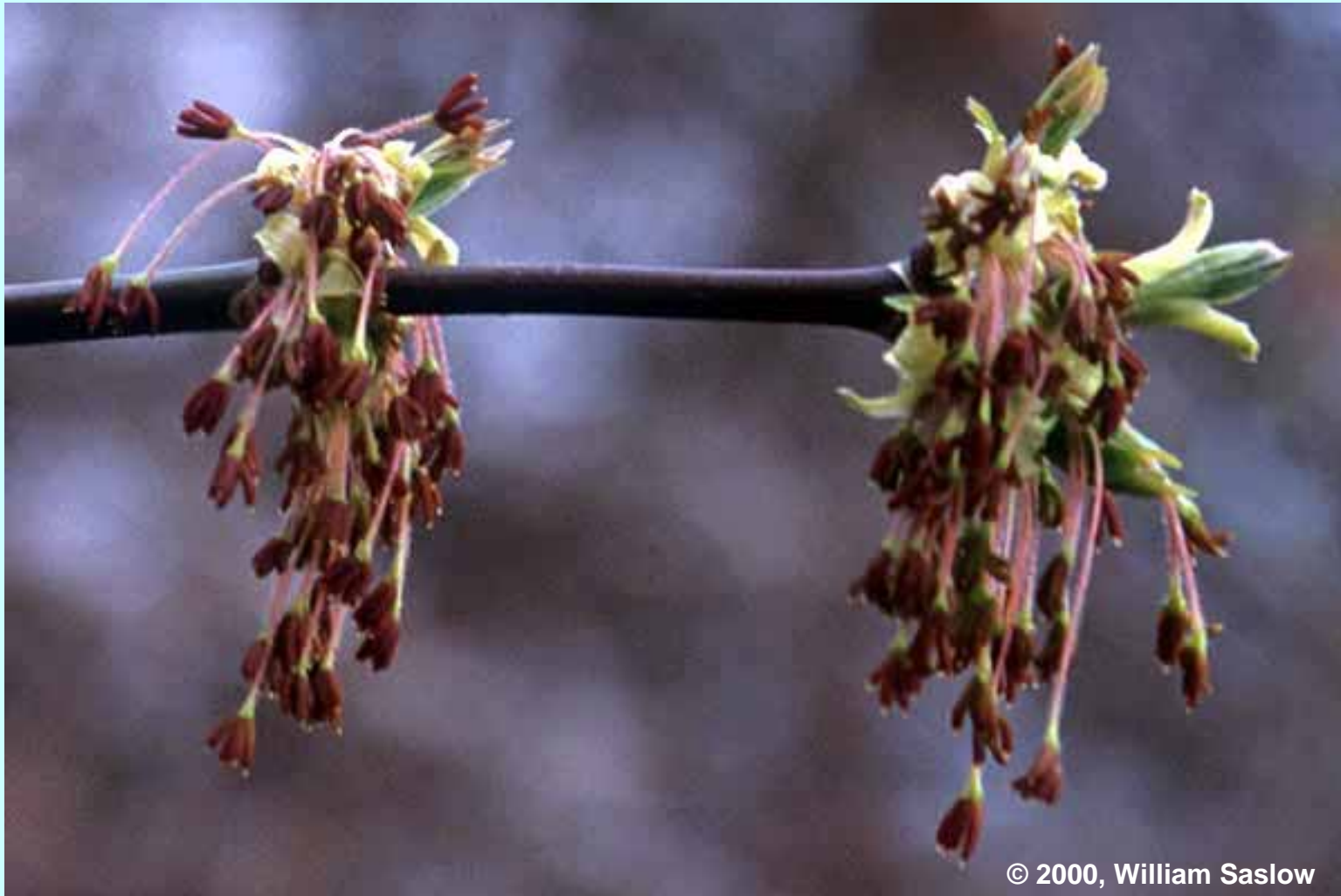
Flowering Red Maple