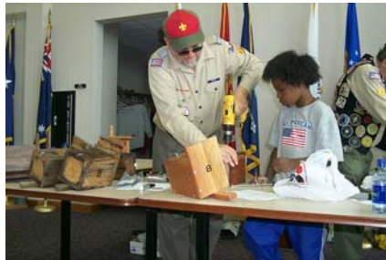
rewhc_2003_08.jpg 05/15/2003 - 595 Kb (3200x2133 - 16,8M colors)

Bluebirds for Aquidneck - Nestbox Building