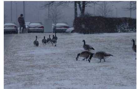
rewhc_2003_09.jpg 05/15/2003 - 824.9 Kb (4733x3167 - 16,8M colors)

Bluebirds for Aquidneck - Nestbox Building