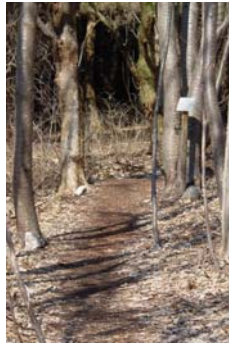
rewhc_2003_02.jpg 05/15/2003 - 1.47 Mb (3167x4733 - 16,8M colors)

Paths to Awareness - Woodland Wander Trail