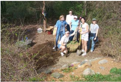
rewhc_2003_16.jpg 05/15/2003 - 1.01 Mb (3200x2133 - 16,8M colors)

Plantings For Diversity - Earth Day Tree Planting