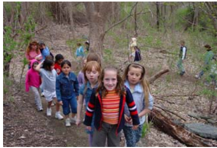
rewhc_2003_05.jpg 05/15/2003 - 1.86 Mb (4733x3167 - 16,8M colors)