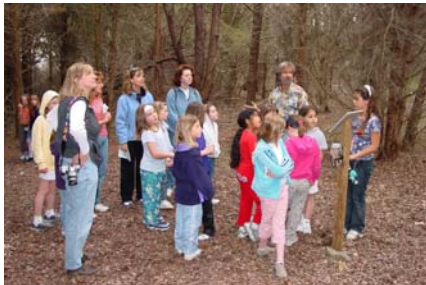
rewhc_2003_07.jpg 05/15/2003 - 1.72 Mb (4733x3167 - 16,8M colors)