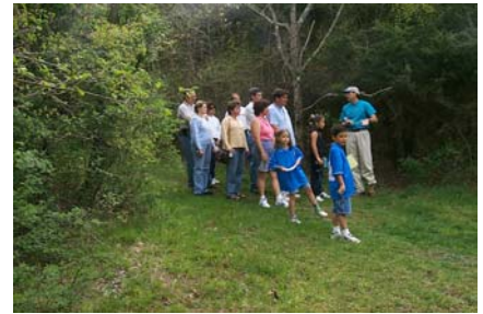
rewhc_2003_18.jpg 05/15/2003 - 949.3 Kb (3200x2133 - 16,8M colors)

Educational Interludes - Earth Day Birdwalk