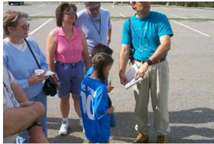
rewhc_2003_17.jpg 05/15/2003 - 689.7 Kb (3200x2133 - 16,8M colors)

Plantings For Diversity - Earth Day Tree Planting