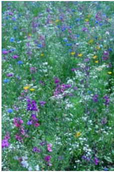
rewhc_2003_01.jpg 05/15/2003 - 2.39 Mb (3167x4733 - 16,8M colors)

For Comprehensive Photo Documentation, See http://rewhc.org/cgi-bin/imagefolio/imageFolio.cgi