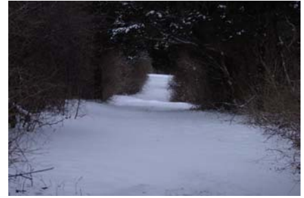
rewhc_2003_15.jpg 05/15/2003 - 998.5 Kb (4733x3167 - 16,8M colors)