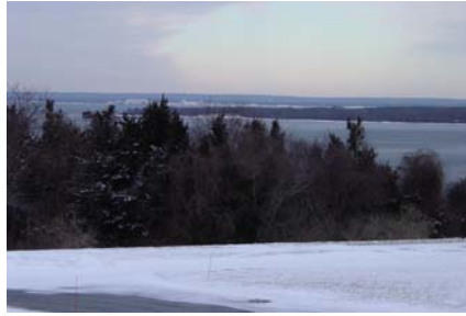
rewhc_2003_14.jpg 05/15/2003 - 875.3 Kb (4733x3167 - 16,8M colors)