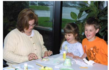
rewhc_2003_12.jpg 05/15/2003 - 1.08 Mb (4500x3000 - 16,8M colors)

Bluebirds for Aquidneck - Nestbox Building