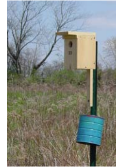
rewhc_2003_06.jpg 05/15/2003 - 1.15 Mb (3167x4733 - 16,8M colors)