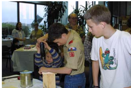
rewhc_2003_11.jpg 05/15/2003 - 1.07 Mb (4500x3000 - 16,8M colors)

Bluebirds for Aquidneck - Nestbox Building