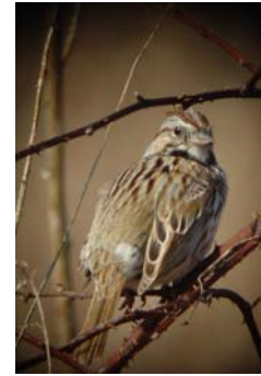
rewhc_2003_03.jpg 05/15/2003 - 764.4 Kb (3167x4733 - 16,8M colors)

Paths to Awareness - Woodland Wander Trail