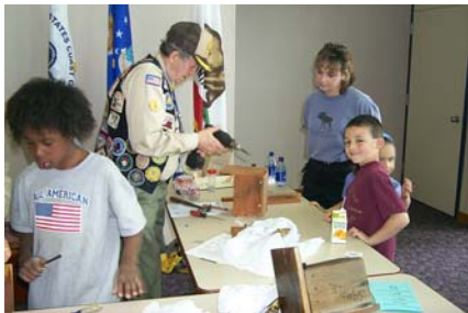
rewhc_2003_10.jpg 05/15/2003 - 556.9 Kb (3200x2133 - 16,8M colors)

Bluebirds for Aquidneck - Nestbox Building