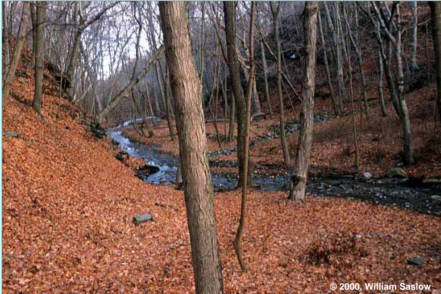
Lawton's Brook in Autumn