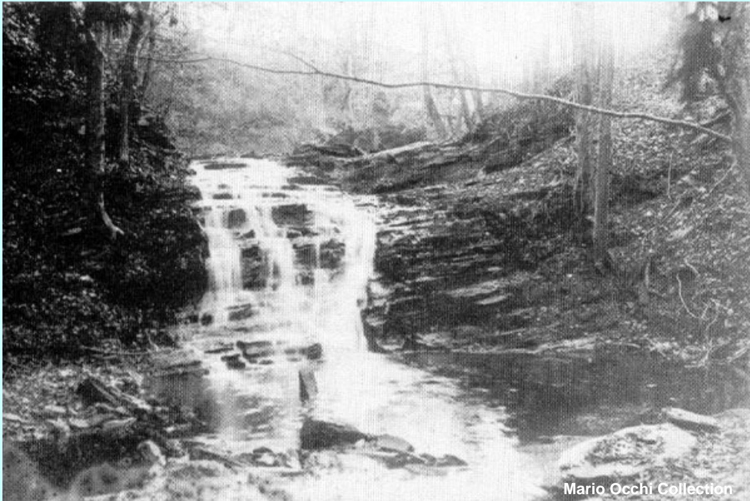
Lawton's Falls c.1890