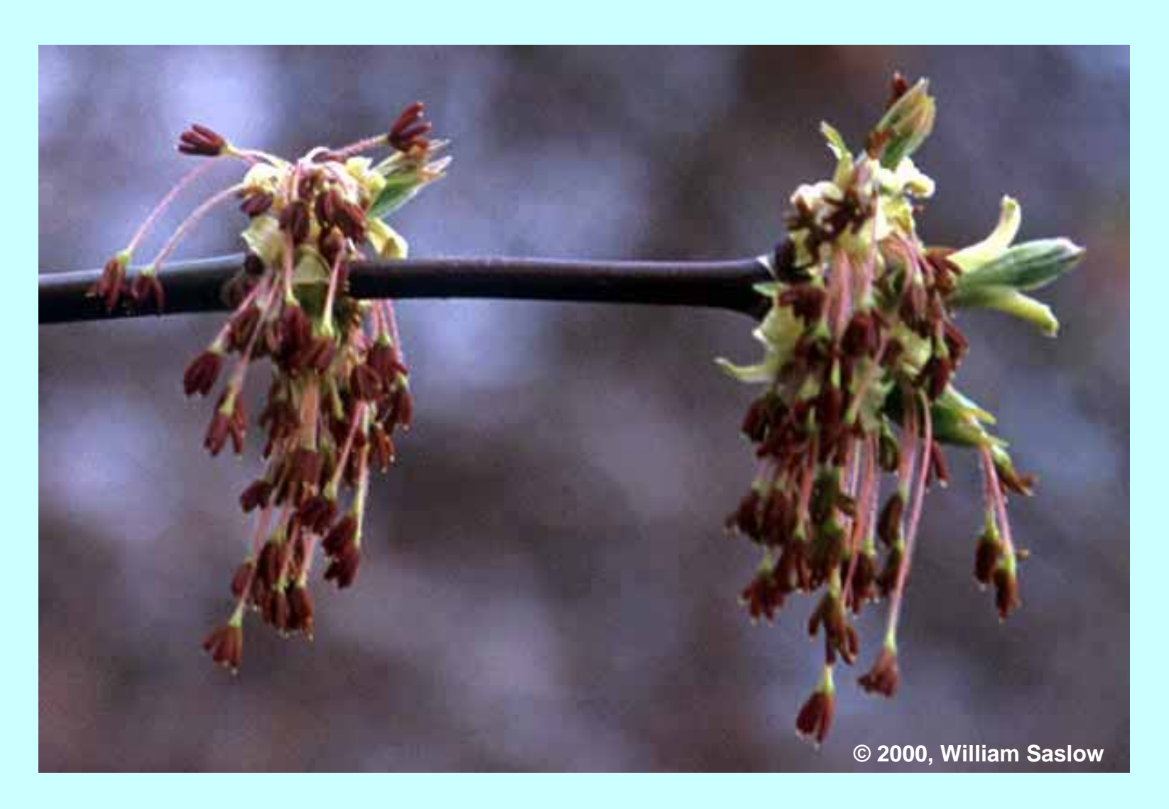
Flowering Red Maple